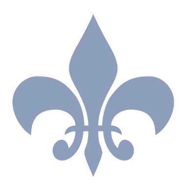
Two Ordre de Liberté members wish to remain Anonymous