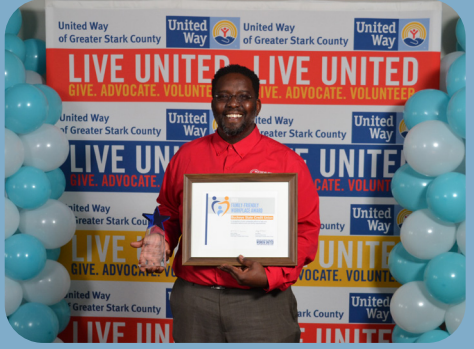
Buckeye State Credit Union