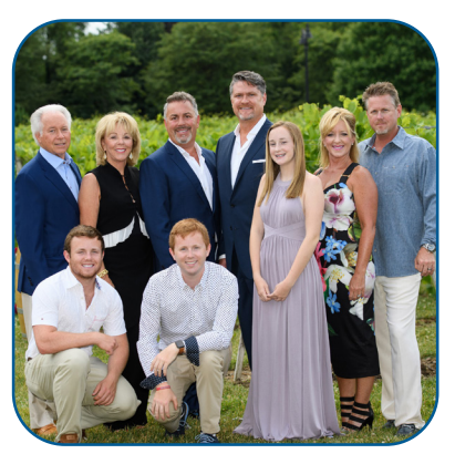
The Swaldo/Blackerby Family Gervasi Vineyard