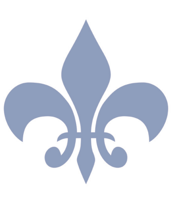
One Ordre de Géneréux member wishes to remain Anonymous