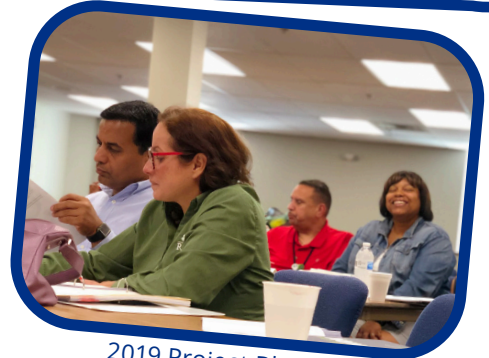
2019 Project Blueprint

Inclusion is one of United Way's core values. It is vital that we continue to discuss and focus on diversity, equity, and inclusion in order to strengthen our community. Participants will hear from a panel as they delve into United Way's work around diversity, equity, and inclusion.