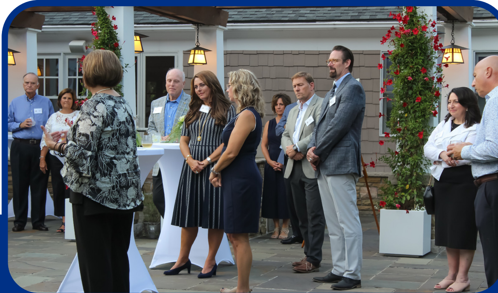
2019 Alexis de Tocqueville Society Appreciation Event

United Way's 2020 Campaign to raise the quality of living for all of us in greater Stark County. Our community thanks you.