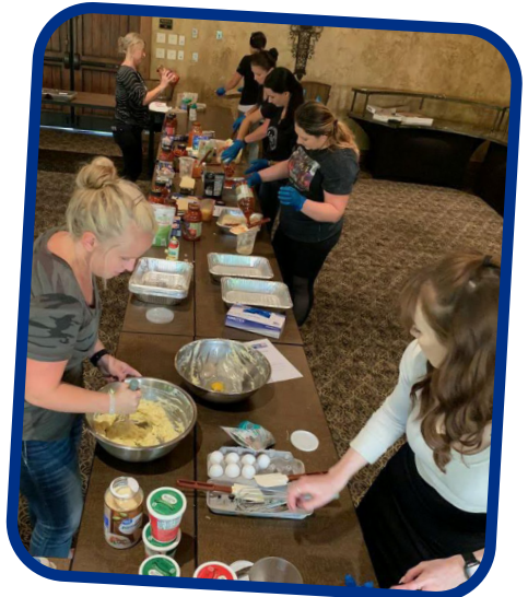
2019 Stone Soup at Gervasi Vineyard

Visit uwstark.org/events for the most current information on upcoming events!