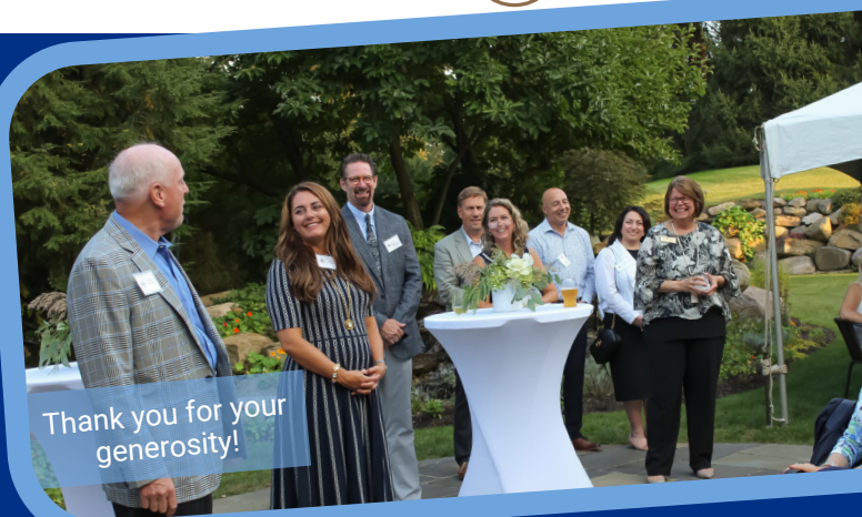
2019 Alexis de Tocqueville Society Appreciation Event

Alexis de Tocqueville Newsletter Spring 2021