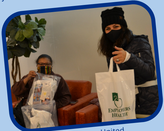
2020 Women United Health Kit Collection

Women United continues their work of supporting and advocating for families in our community. Plans are in the works for a summer collection event to support local women's agencies and for the annual fall Family-Friendly Workplace Awards.