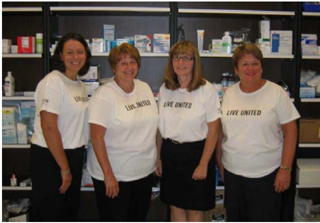
Prescription Assistance Network employees participate in Wear Your LIVE UNITED Shirt to Work Day