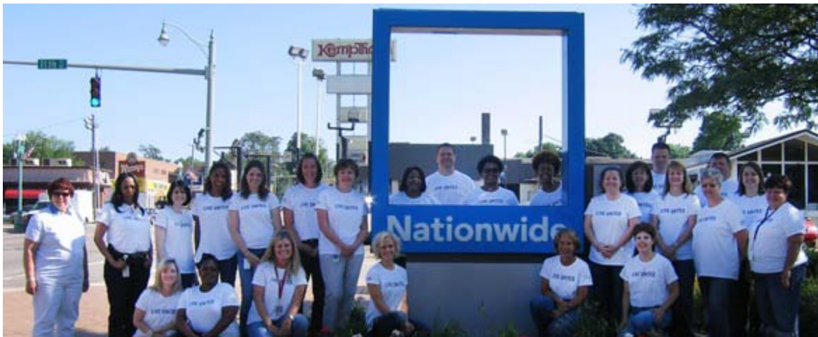
Nationwide employees participate in Wear Your LIVE UNITED Shirt to Work Day on United Way's Virtual Day of Action June 21